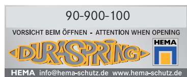
DURASPRING label with article number

If the spiral springs are exposed regularly to coolants with a high proportion of water, then stainless steel band should be used. Stainless spiral springs have lower spring forces and therefore cannot be manufactured in all sizes. We use spring band steel of extreme hardness (55-58 Rockwell) with chamfered edges and a strength of up to 1800 N/mm 2 for our standard spiral springs. Band steel in thicknesses from 0.2 to 1.0 mm will be selected in accordance to size and application. Since this is documented within our quality system, reproducibility is also guaranteed when re-ordering.