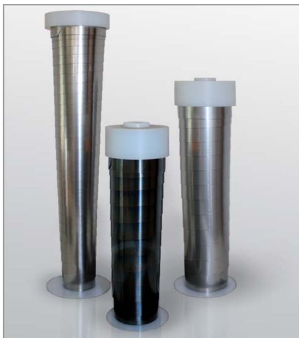
DURASPRING in standard and stainless steel

DURASPRING Spiral Springs are available in two versions: