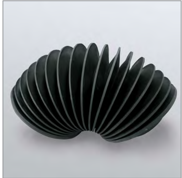
Rubber disk bellow

Rubber disk bellows are supplied in standard sizes with inside diameters of 20 to 400 mm and outside diameters of 40 to 480 mm.